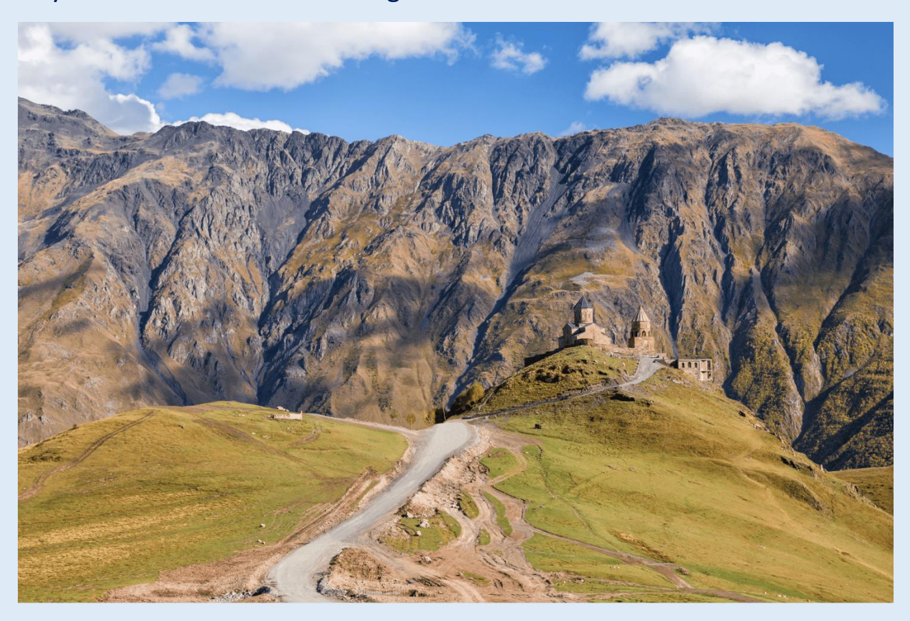
Day 4: Tbilisi – Ananuri – Kazbegi – Gudauri – Tbilisi

In the morning, we will embark on a journey northward along the renowned Georgian Military Highway , where nature's splendour and history blend harmoniously.