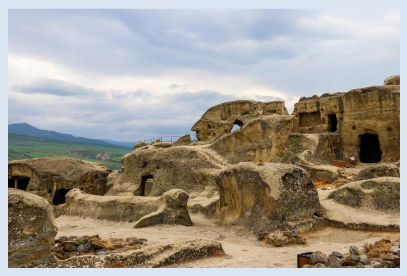
Day 2: Kutaisi – Gori – Uplistsikhe – Mtskheta – Tbilisi

In the morning, we leave Kutaisi and head to the capital of Georgia – Tbilisi. On our way, however, we have several fascinating stops to make.