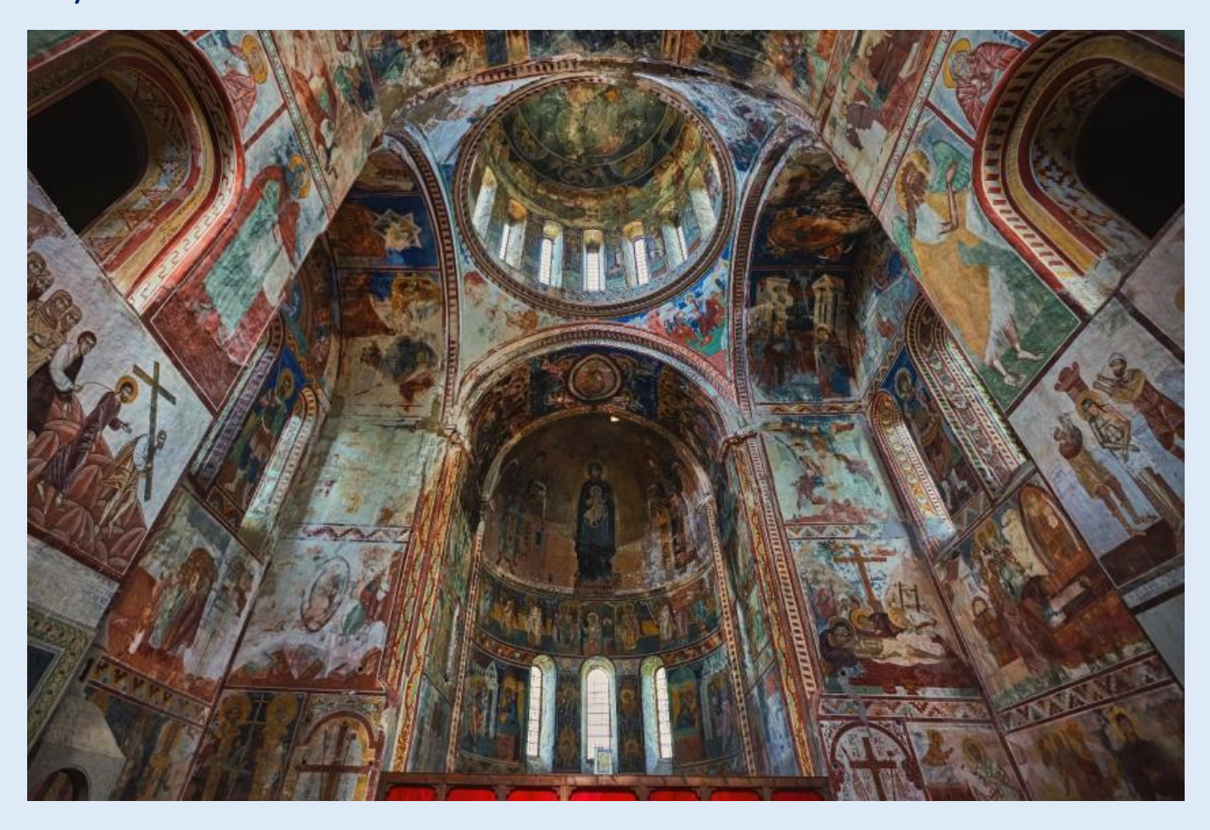
Day 7: Tbilisi – Prometheus Cave – Gelati – Kutaisi

After breakfast, we leave the lively capital and return to the enchanting Kutaisi.