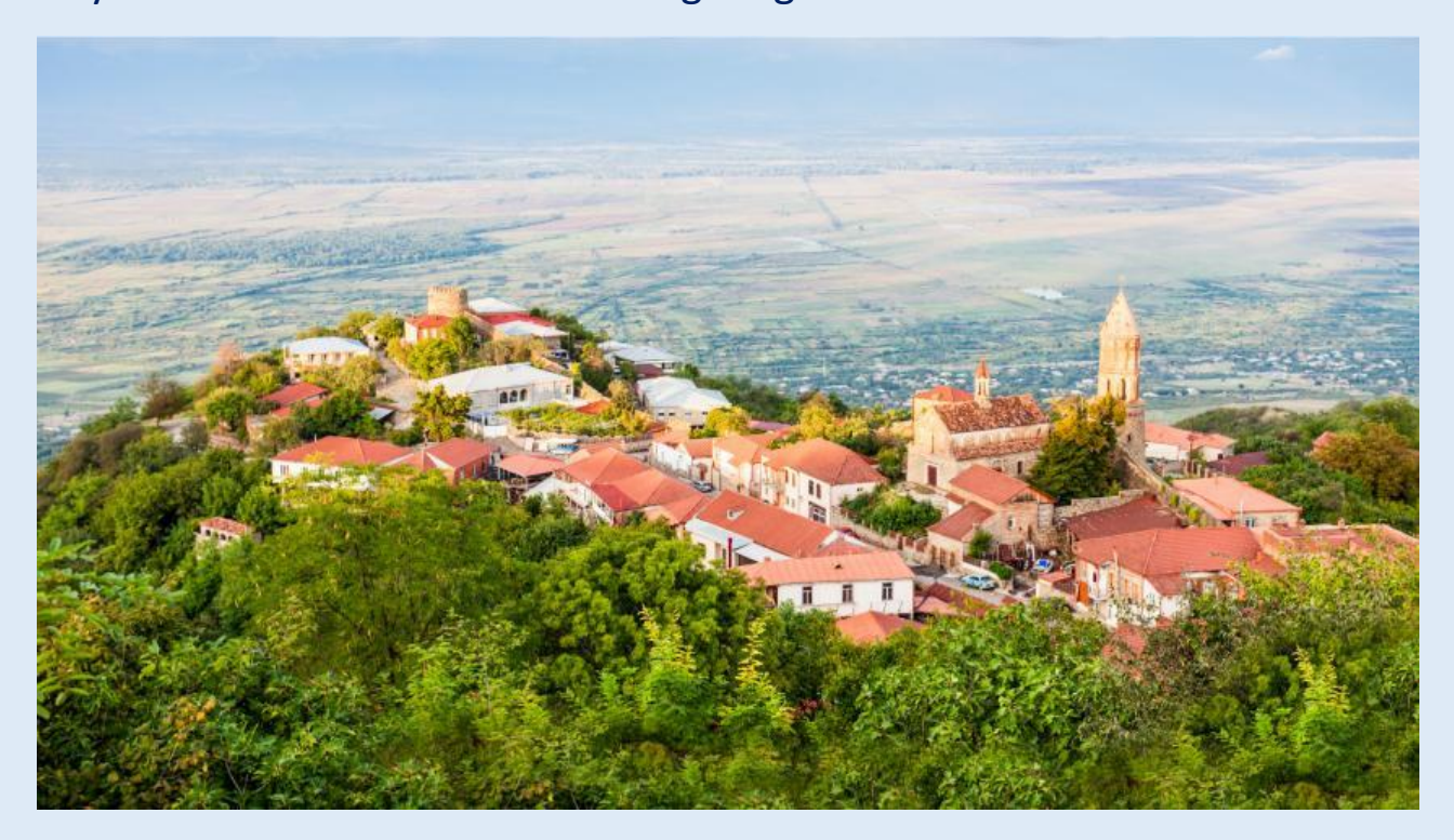
Day 6: Telavi – Gremi – Kvareli – Sighnaghi – Bodbe – Tbilisi

Having left Telavi in the morning, we will delve into the captivating history of Gremi's Archangels' Complex . We will discover the well-preserved ruins of Gremi Fortress , once a flourishing trade and cultural centre along the Silk Road.