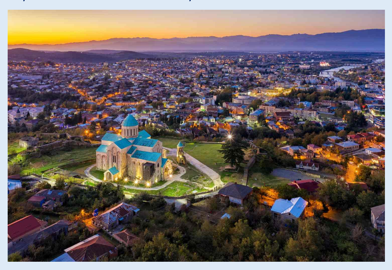
Day 1: Arrival in Kutaisi – Kutaisi City Tour

Guests will arrive at Kutaisi International Airport early in the morning. After being greeted by the driver and guide, they will be transferred to the hotel.