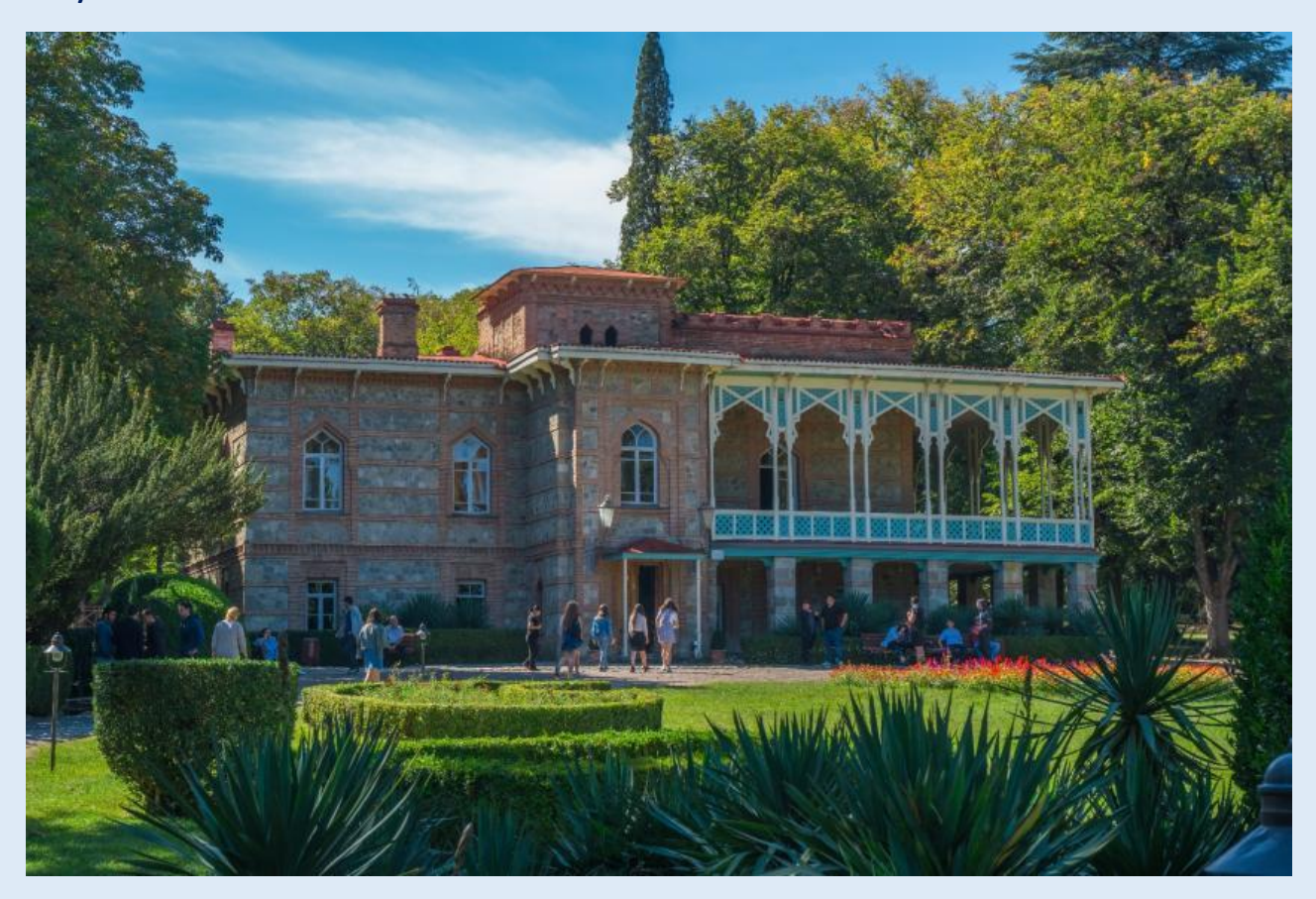
Day 5: Tbilisi – Ikalto – Alaverdi – Tsinandali – Telavi

Our journey takes us to the region of Kakheti – "the cradle of wine". Its winemaking method using Kvevri, a unique ancient vessel, has been recognized by UNESCO as an Intangible Cultural Heritage.