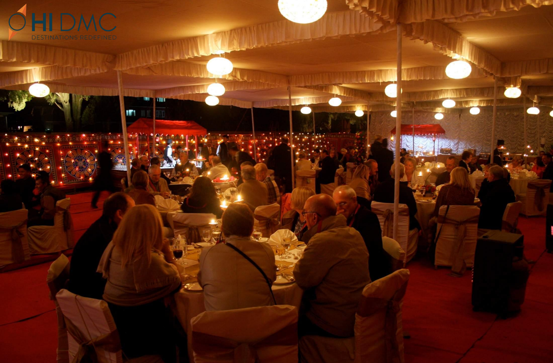
Dinner amidst great setting (Backdrop of Durbar Square, Himalayan ranges)