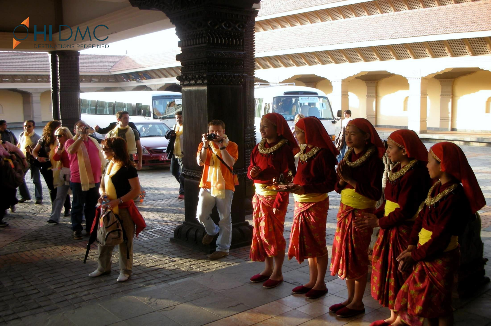
Special Panch Kanya Traditional Welcome