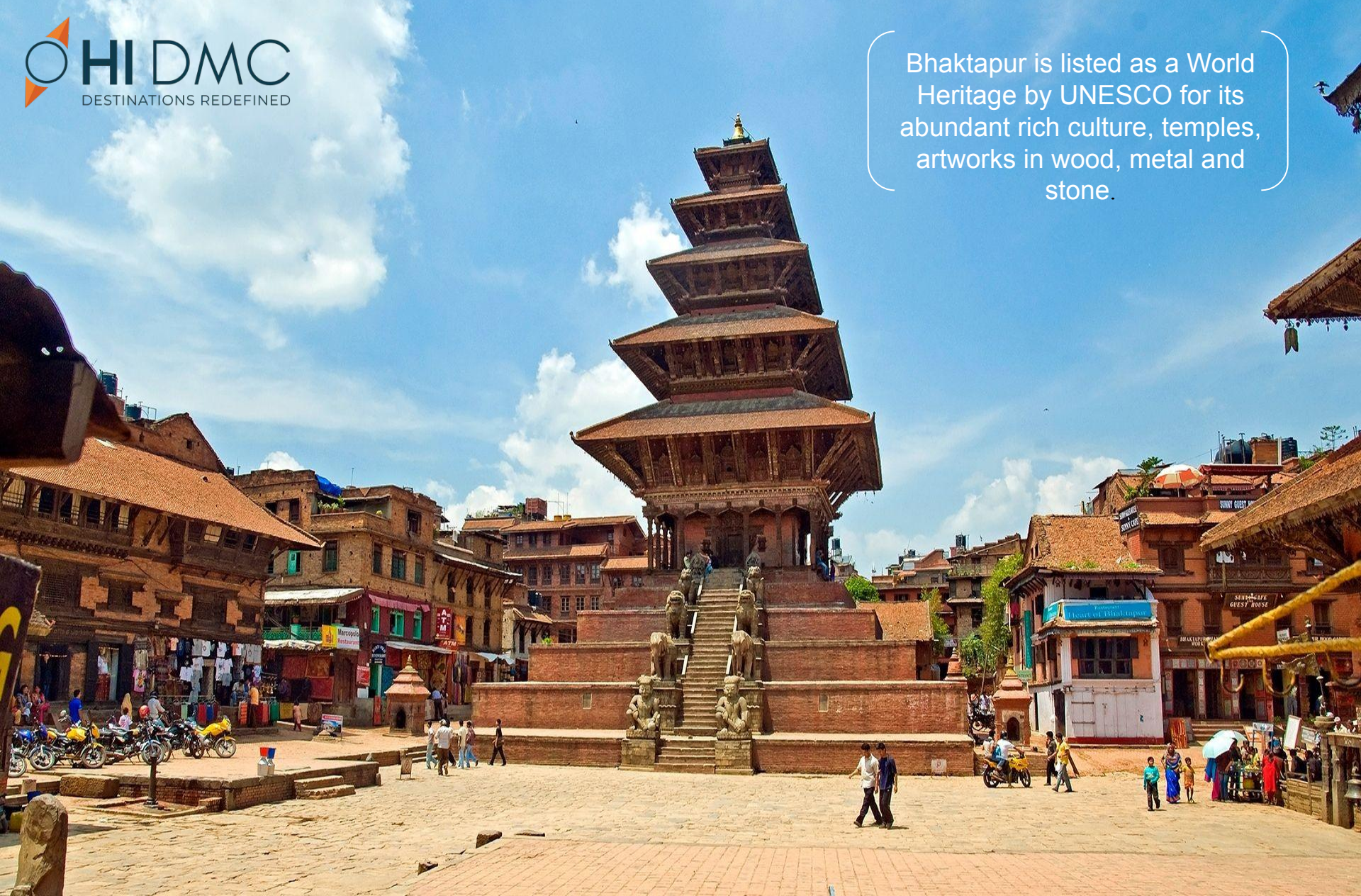
Bhaktapur Durbar Square: Exploring the cultural gem

Bhaktapur is listed as a World Heritage by UNESCO for its abundant rich culture, temples, artworks in wood, metal and stone.