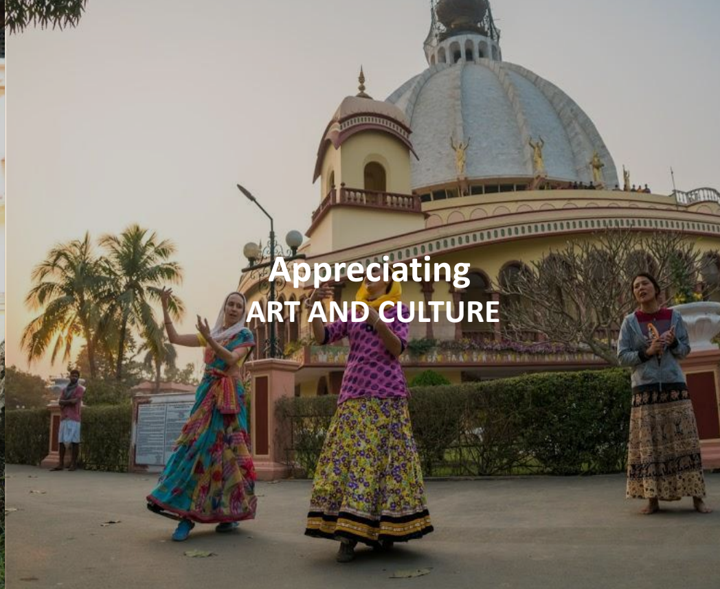
Appreciating ART AND CULTURE