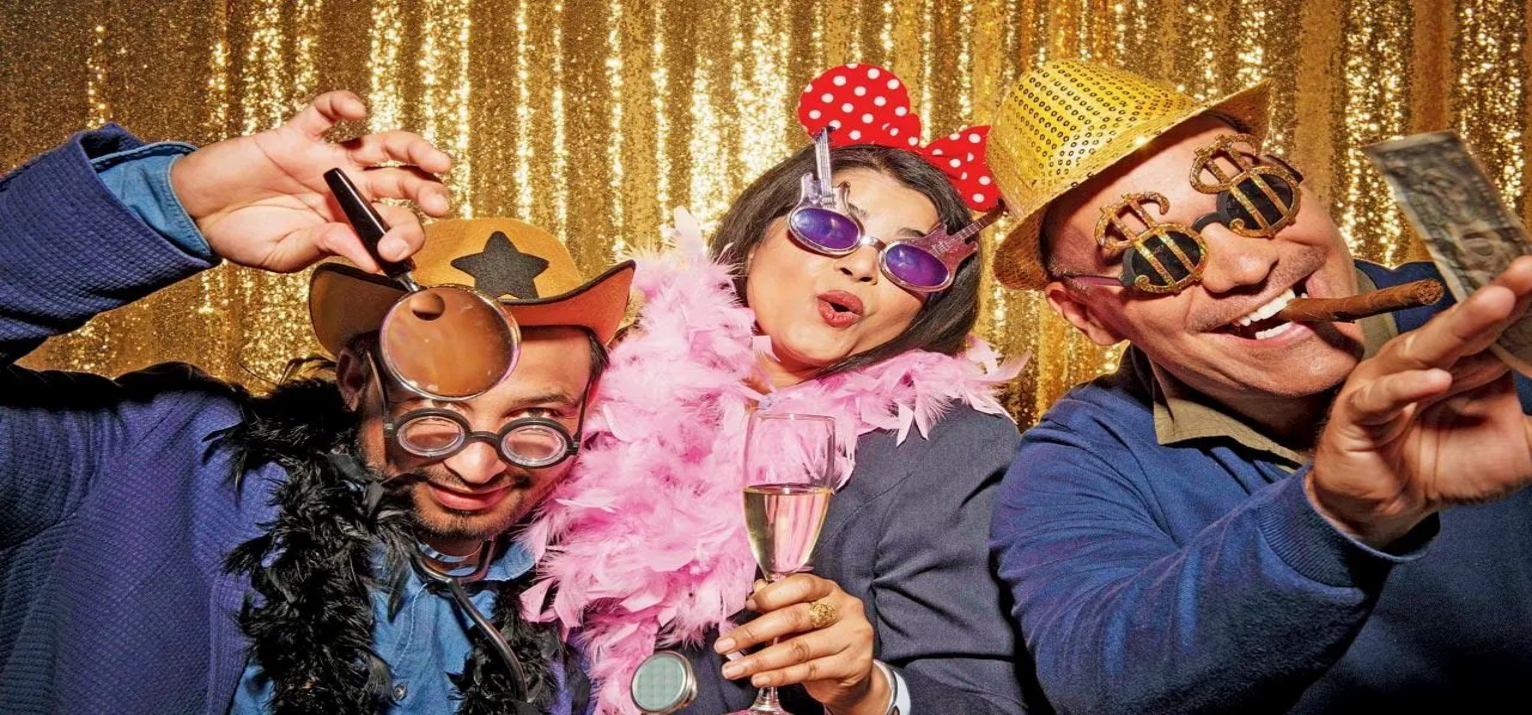
Exclusive Bollywood Theme Gala Dinner