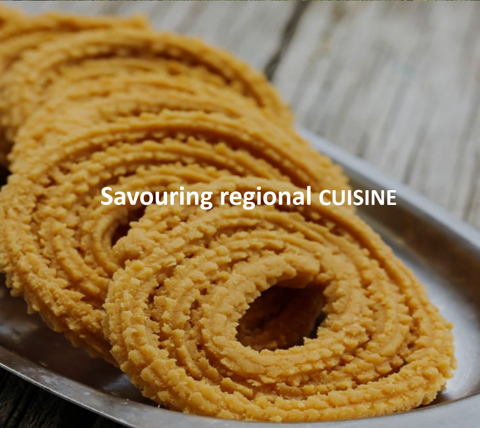
Savouring regional CUISINE