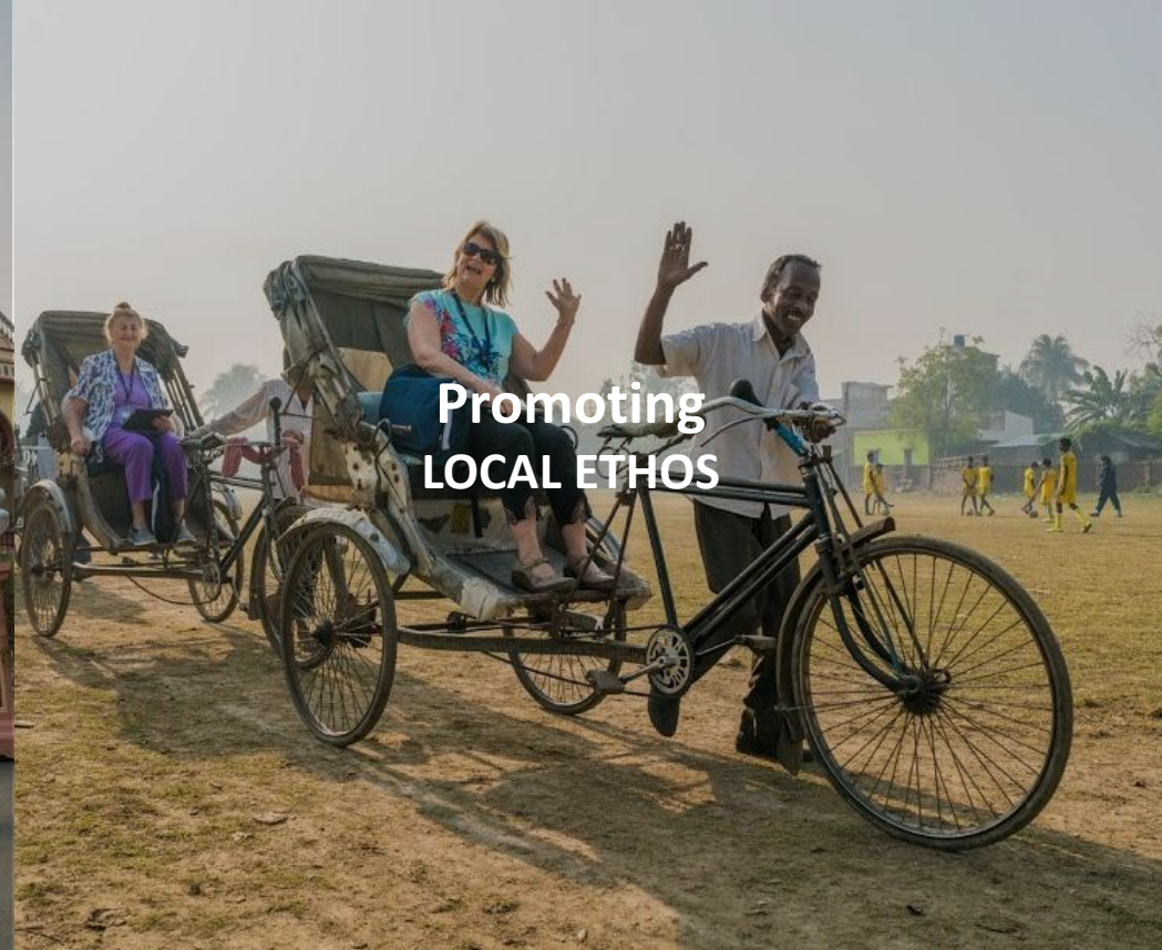
Promoting LOCAL ETHOS