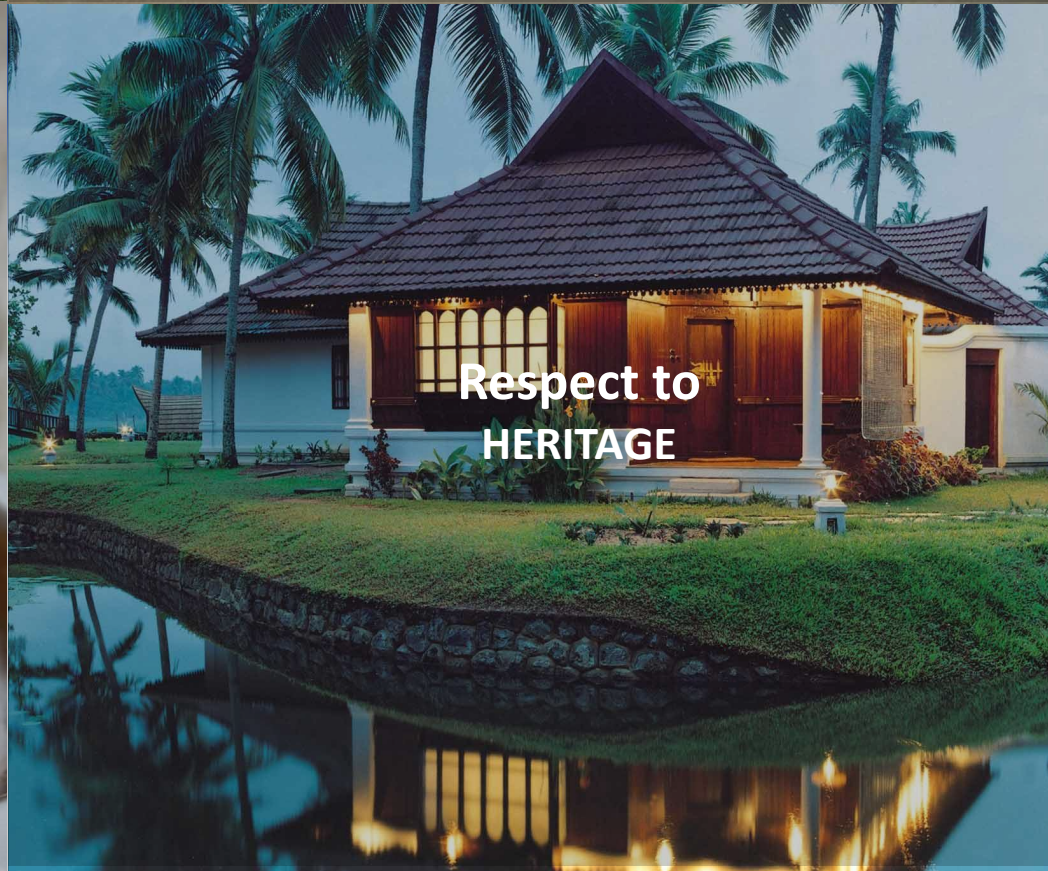
Respect to HERITAGE