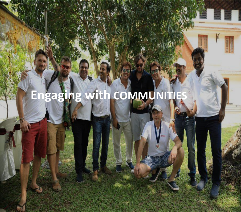
Engaging with COMMUNITIES